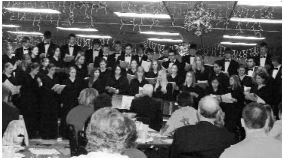
Chamber members enjoy the high school choir at the holiday luncheon.